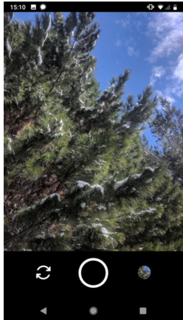
Figure 1. Camera Adversaria capture view.

The presence of the model’s prediction serves to remind a user of the machine readability of images that will be exploited should the image ever find its way onto a social network or cloud storage. While this is an important element of the critical work that Camera Adversaria does, it may serve to make a user overly confident in the robustness of the adversarialised image. While there is evidence that adversarial perturbations work across DL models [35] it may be the case that those running in the servers of large tech companies are more resistant to adversarial perturbations or are trained to identify objects that